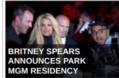
BRITNEY SPEARS ANNOUNCES PARK MGM RESIDENCY