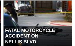
FATAL MOTORCYCLE ACCIDENT ON NELLIS BLVD