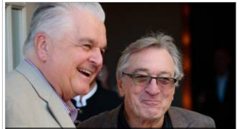
ROBERT DE NIRO ATTENDS NOBU HOTEL 5TH ANNIVERSARY CELEBRATION